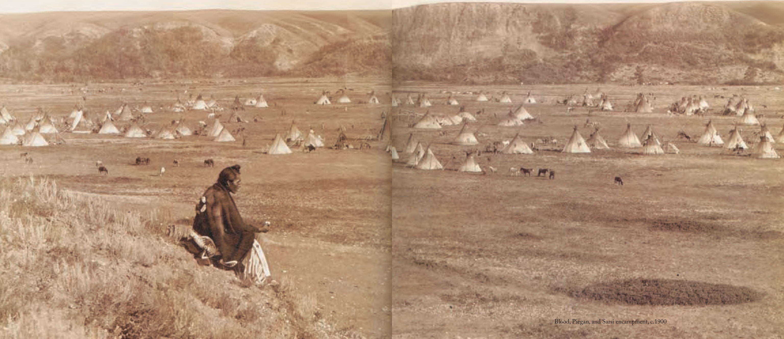
Blood, Piegan, and Sarsi encampment, c.1900

When circumstances are favorable, the Indians are the happiest people in the world. There were entertainments every single day, which everybody had the fullest opportunity to see and enjoy. If anything, the poorest profited the most by these occasions, because a feature in each case was the giving away of wealth to the needy in