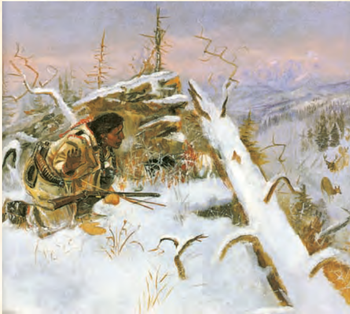
Charles Russell, Crow Indians Hunting Elk (detail), c.1887 Opposite: Roland W. Reed, The Landmark , 1912

meal, we stopped to speculate on the time it was done. If we saw a large old tree with some scratches on its bark, we concluded that a bear or some raccoons must be living there. In that case we did not go any nearer than was necessary, but later reported the incident at home. An old deer-track would at once bring on a warm discussion as to whether it was the track of a buck or a doe.