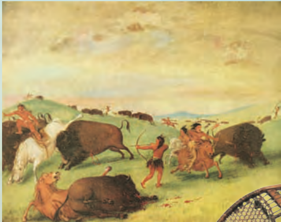
George Catlin, Buffalo Chase, Upper Missouri