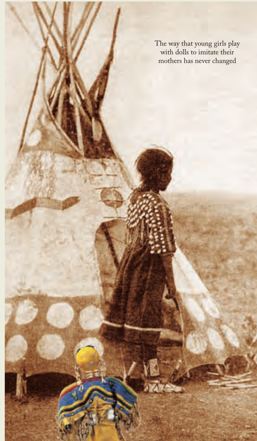
The way that young girls play with dolls to imitate their mothers has never changed