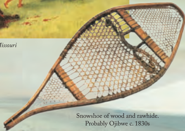
Snowshoe of wood and rawhide. Probably Ojibwe c. 1830s