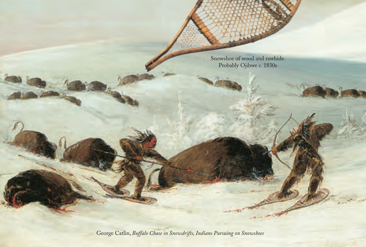
George Catlin, Buffalo Chase in Snowdrifts, Indians Pursuing on Snowshoes