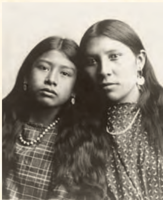
Two Crow girls

The herald soon completed the rounds of the different camps, and it was not long before the girls began to gather in great numbers. This particular feast was looked upon as a semi-sacred affair. It would be