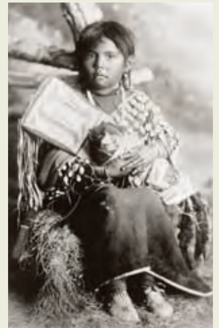
Crow girl with doll in cradle board