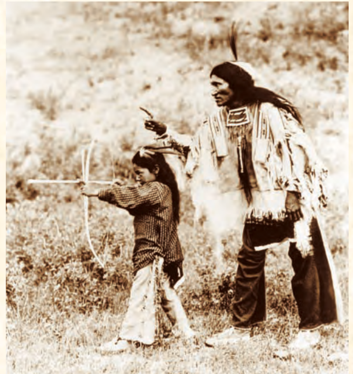
Dakota father teaching a child to shoot with an arrow

Last of all came the swimming. We loved to play in the water. When we had no ponies, we often had swimming match-