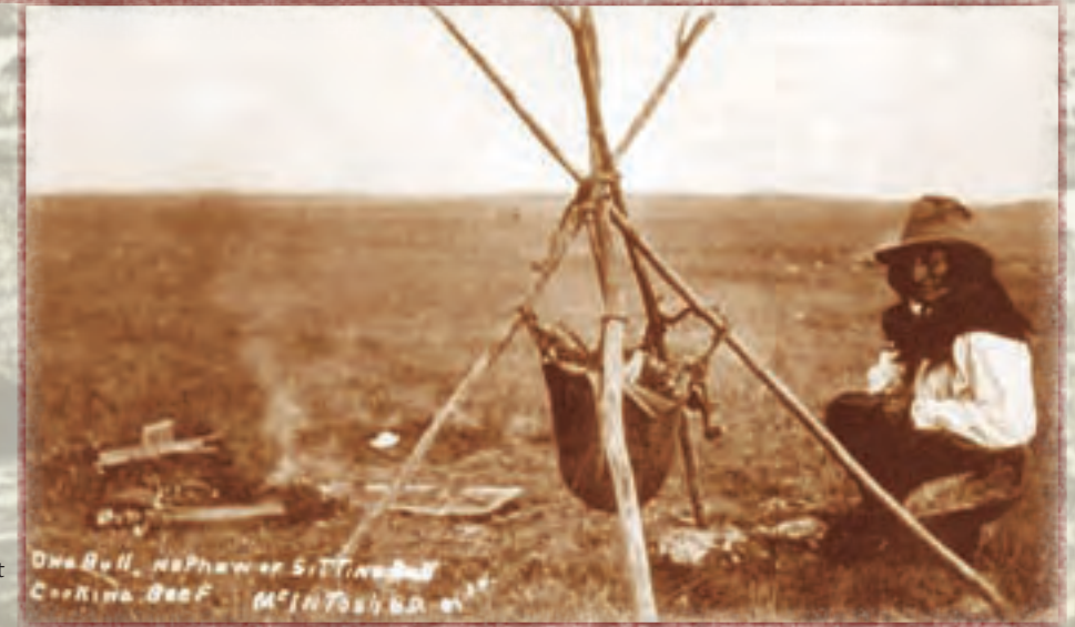
ONE BULL, ASPHAWER SITTIN COOKING BEEF MONTANA 1870