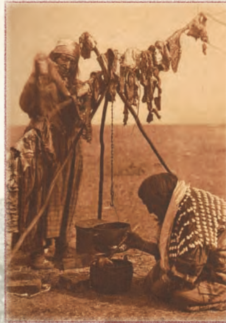
Above: Blackfoot cookery and smoking meat Right: Sioux man cooking meat in buffalo-stomach