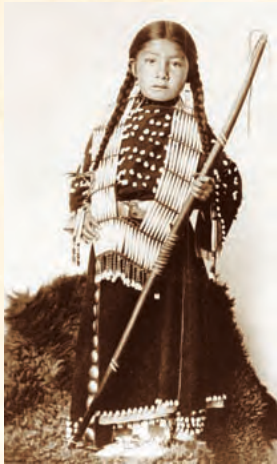
The young girls assisted their mothers in all things in order to become the owner of their own homes at the time of their marriages

The Indian mother was the spiritual teacher of the child, as well as its tender nurse, and she brought its developing soul before the "Great Mystery" as soon as she was aware of its coming. At the age of five to eight years, she turned her boy over to his father for manly training, and to the grandparents for traditional instruction, but the girl child remained under her close and thoughtful supervision. She preserved man from soul-killing materialism by herself owning what few possessions they had, and thus brand-