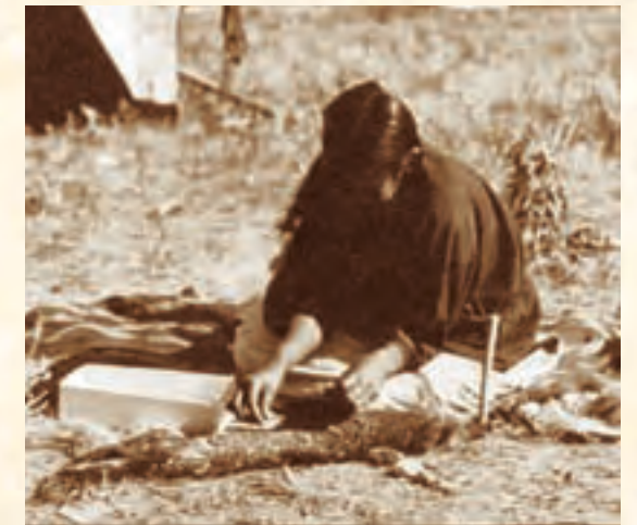
Sioux woman plucks quills from a porcupine skin. Women softened and dyed the quills before they used them to decorate clothing.

At last we were reduced very much, and the prospect of obtaining anything soon being gloomy, my grandmother reluctantly suggested that the squirrel should be killed