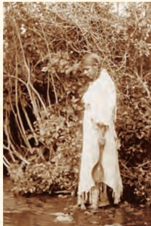
This young maiden carries a spoon made from a buffalo horn in her hand