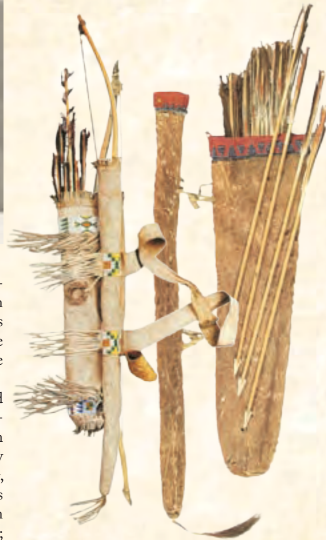
The young boys spent hours practicing to shoot with the bow and arrows

It was considered out of place to shoot by first sighting the object aimed at. This was usually impracticable in actual life, because the object was almost always in motion, while the hunter himself was often upon the back of a pony at full gallop. Therefore, it was the off-hand shot that the Indian boy sought to master.