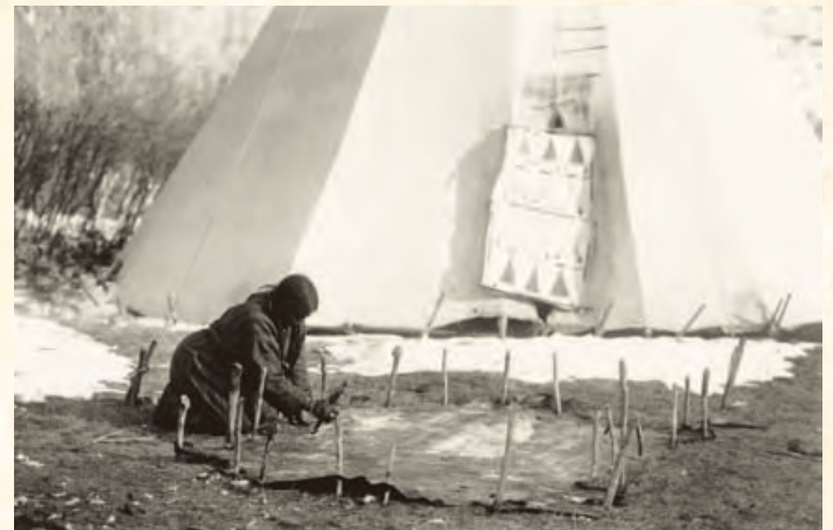
A woman preparing a buffalo hide

for food. Thereupon my little cousin cried, and said: "Why cannot we all die alike wanting? The squirrel's life is as dear to him as ours to us," and clung to it. Fortunately, relief came in time to save her pet.