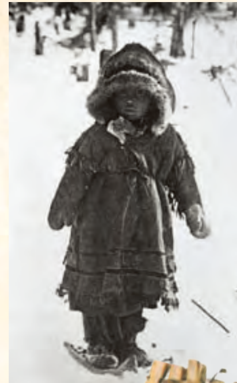
Children in the North woods needed snow shoes during the winter

We had some quiet plays which we alternated with the more severe and warlike ones. Among them were throwing wands and snow-arrows. In the winter we coasted much. We had no “double-rippers” or toboggans, but six or seven of the long ribs of a buffalo, fastened together at the larger end, answered all practical purposes. Sometimes a strip of bass-wood bark, four feet long and about six inches wide, was used with considerable skill. We stood on one end and held the other, using the slippery inside of the bark for the outside, and thus coasting down long hills with remarkable speed.