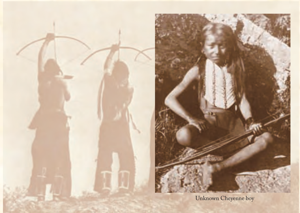
Unknown Cheyenne boy

Sometimes my uncle would wake me very early in the morning and challenge