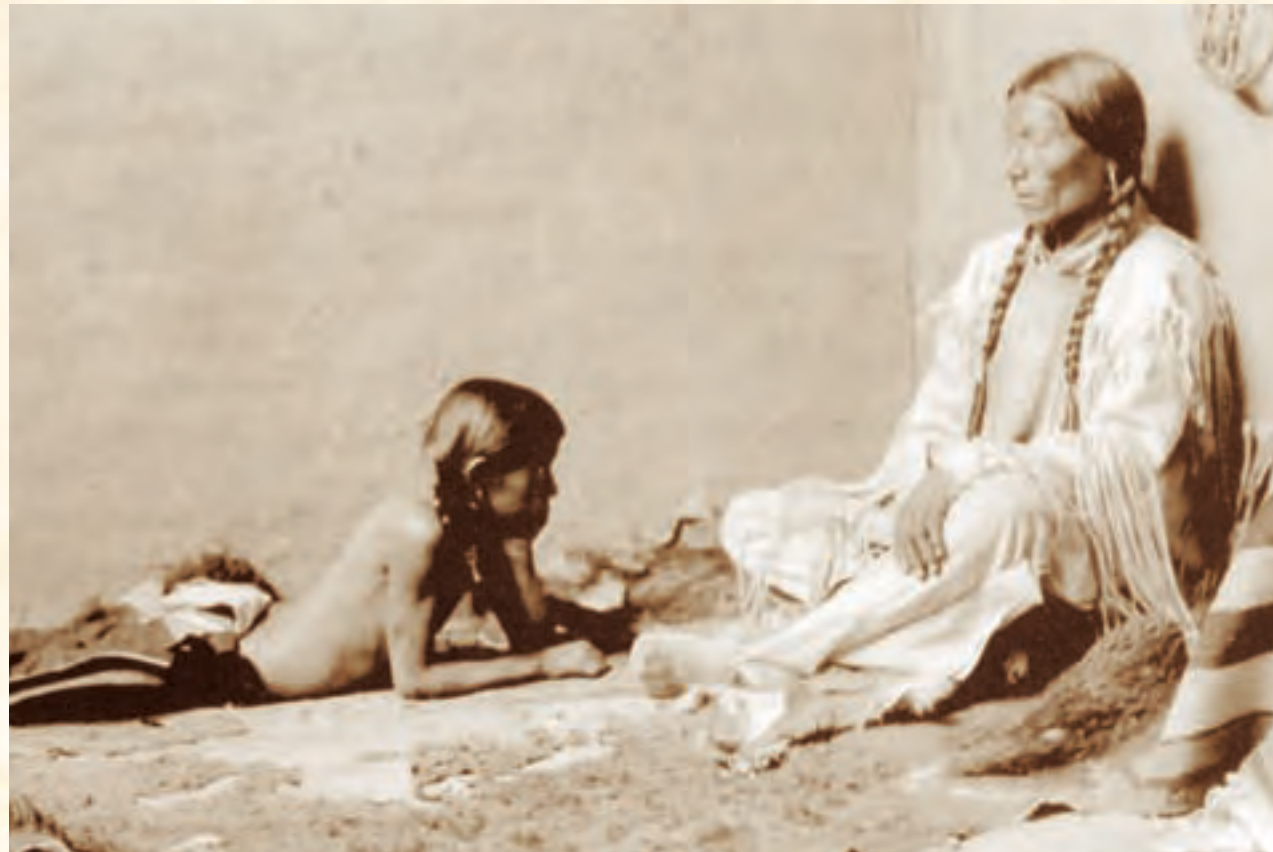
A Tale of the Tribe, c.1909, Taos Pueblo

Nothing could be farther from the truth. All the customs of this primitive people were held to be divinely instituted,