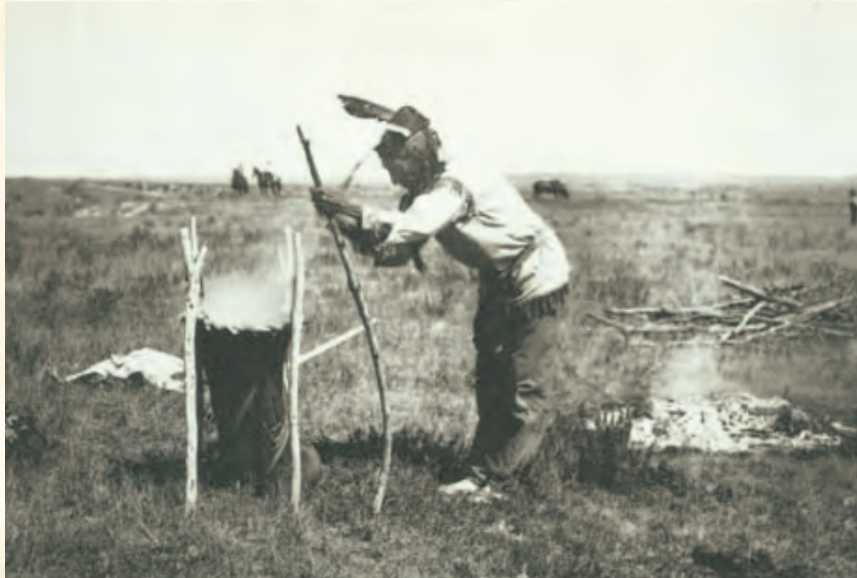
Sioux man cooking meat by throwing heated stones into a buffalo-stomach container

Our people had also a method of boiling without pots or kettles. A large piece of tripe was thoroughly washed and the ends tied, then suspended between four stakes driven into the ground and filled with cold water. The meat was then placed in this novel receptacle and boiled by means of the addition of red-hot stones.