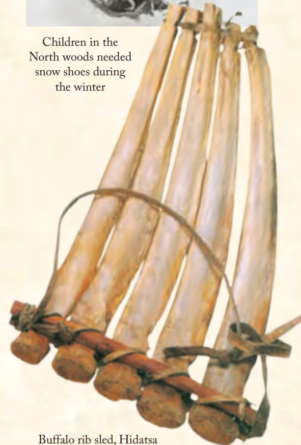
Buffalo rib sled, Hidatsa