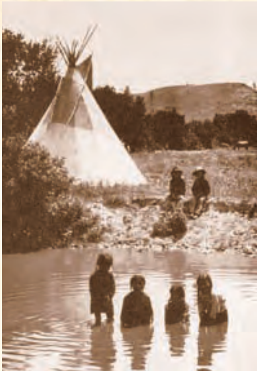
Children playing, Unknown Cheyenne

es of our own and sometimes made rafts with which we crossed lakes and rivers. It was a common thing to “duck” a young or timid boy or to carry him into deep water to struggle as best he might.