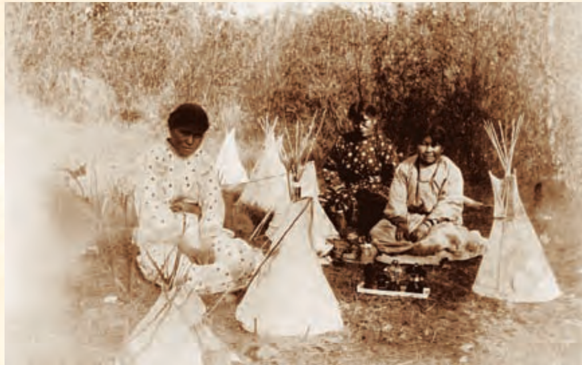
Girls with toy tipis and dolls, Unknown Cheyenne