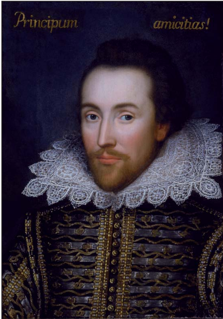
Shakespeare in 1610. The painting was recently discovered after being 'lost' for over 400 years. The inscription reads Principum amicitias! ("The Friendships of Princes!") quoted from Horace's Odes , book 2, ode 1